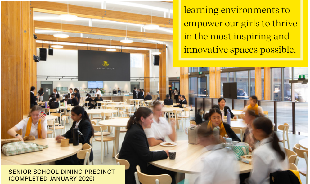
SENIOR SCHOOL DINING PRECINCT (COMPLETED JANUARY 2026)

With your help, we can continue to advance our learning environments to empower our girls to thrive in the most inspiring and innovative spaces possible.