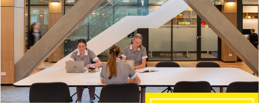
SENIOR SCHOOL BETTY ARCHDALE LIBRARY (COMPLETED JANUARY 2025)

With your help, we can continue to advance our learning environments to empower our girls to thrive in the most inspiring and innovative spaces possible.