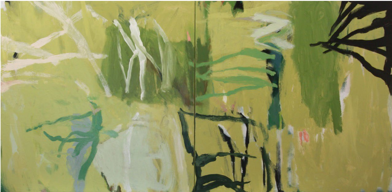
Grass Talk, 2023, oil on canvas (diptych), 102 X 204 cm