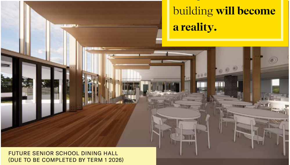
FUTURE SENIOR SCHOOL DINING HALL (DUE TO BE COMPLETED BY TERM 1 2026)

With your help, the next phase of the building will become a reality.