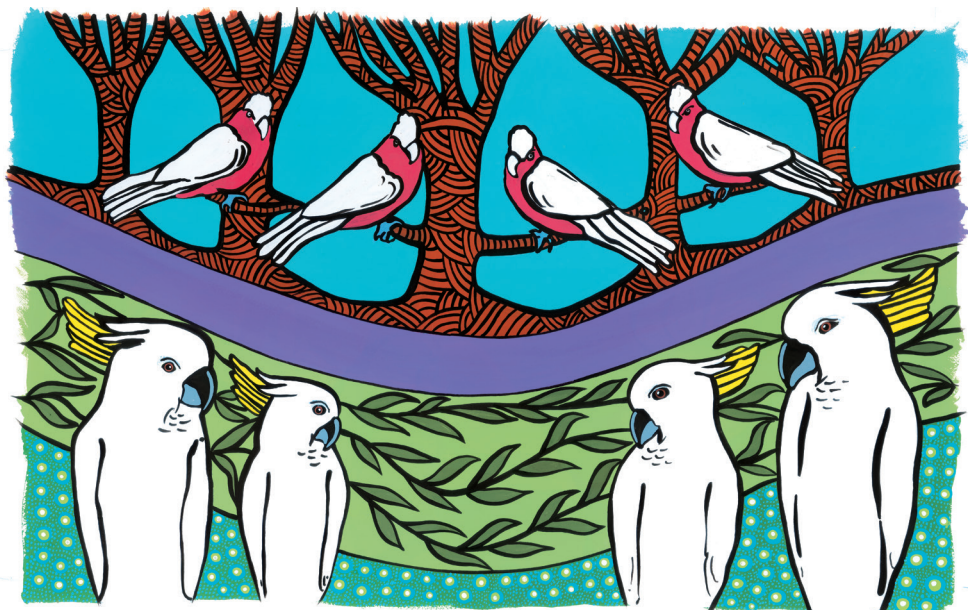
Cockatoo and galah