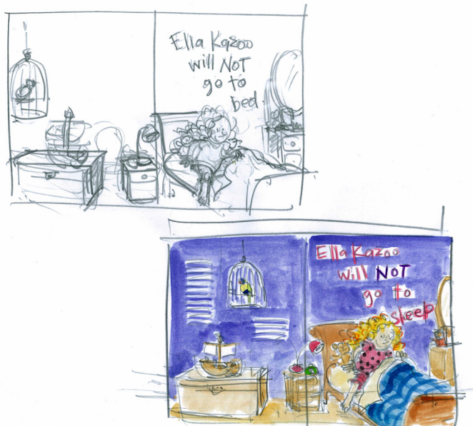
Ella Kazoo will not go to bed