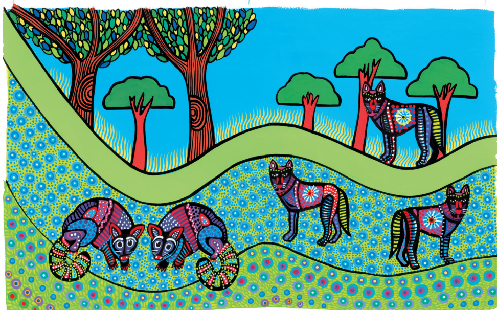
Brush-tailed possum and dingo