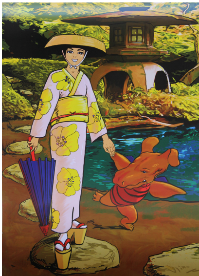
Musume and Bento Boy Emirates poster