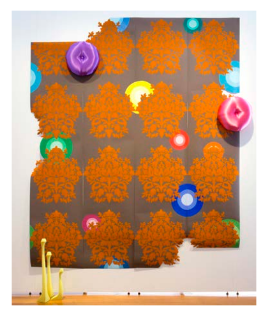
Velvet Constellations, 2017 Flock wallpaper, acrylic, satin 254 x 212 cm