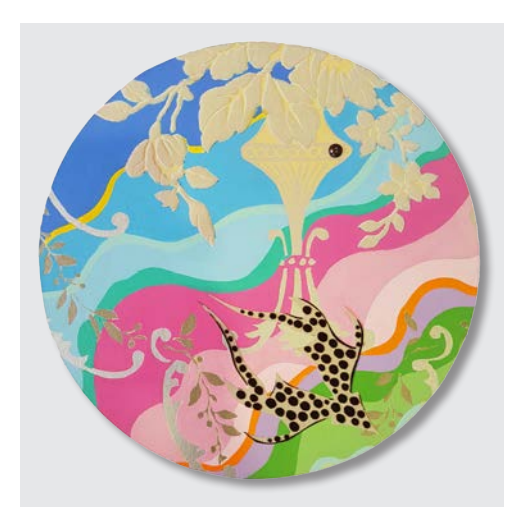
Flock Fall, 2016-17 Flock wallpaper, upholstery pins and acrylic on board 33 x 33 cm