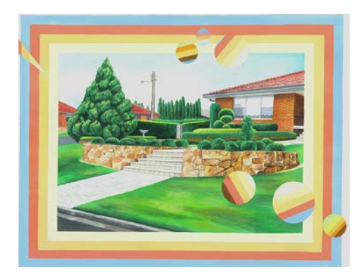
Crop Circle House, 2016 Gouache on Arches heavy watercolour paper 53 x 67 cm

Bubble-gum House, 2016 Gouache on Arches heavy watercolour paper 60 x 50 cm