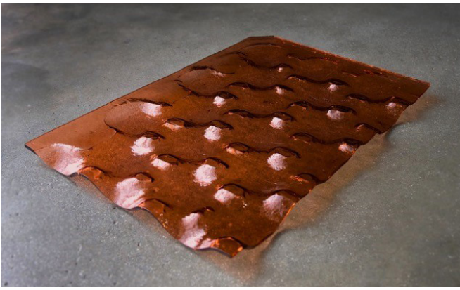
Jacqueline Bradley Fruit tray (detail) 2024, Kiln formed glass, 2 x 20 x 30 cm