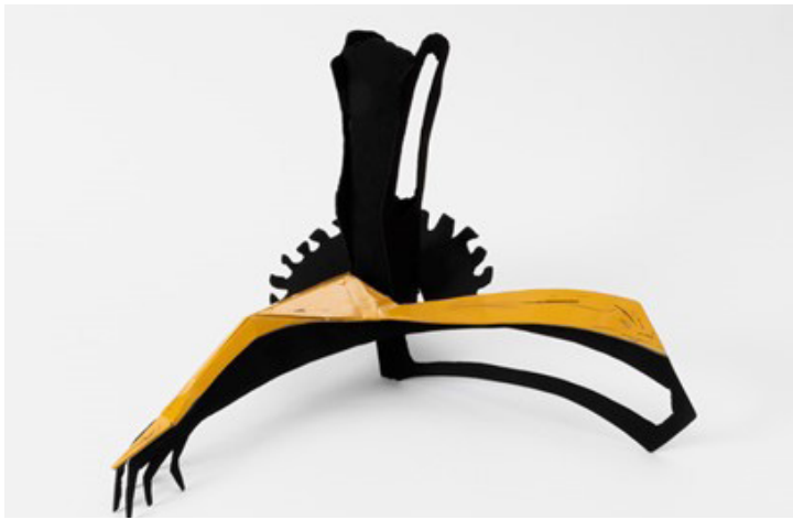
Ingrid Morley The Past is Just Behind, steel, 36 x 52 x 33 cm