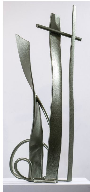
Jan King SAFFAR, 2022, Steel 104 x 44 x 22 cm