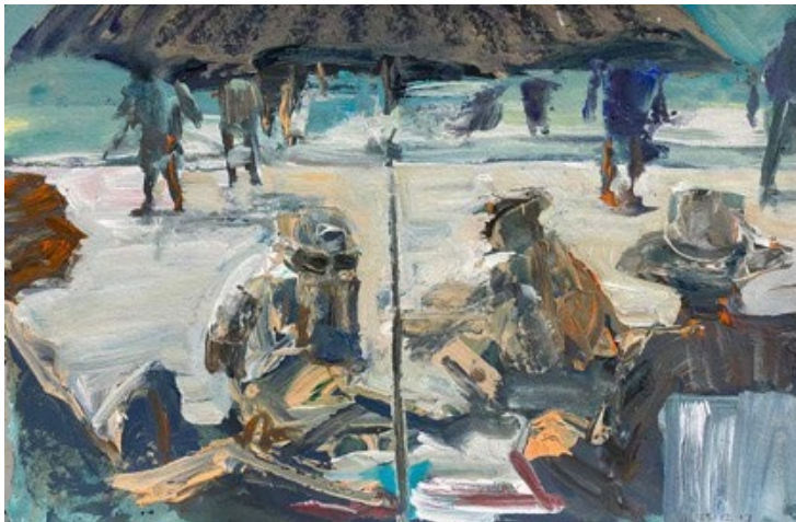
Family under umbrella , 2017 acrylic on paper, 38 x 58 cm