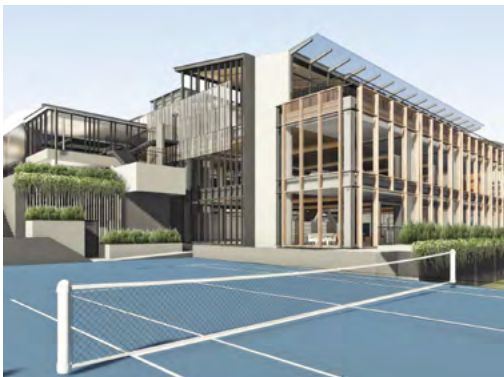
FUTURE SENIOR SCHOOL LIBRARY

Thank you so much to our generous donors for helping to create our new learning environments.