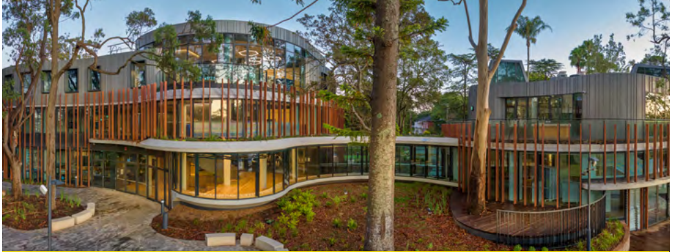
SENIOR SCHOOL SCIENCE AND ART BUILDINGS (COMPLETED IN LATE 2022)

With your help, the next phase of building will become a reality.