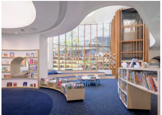
JUNIOR SCHOOL LIBRARY (COMPLETED IN LATE 2022)

With your help, the next phase of building will become a reality.