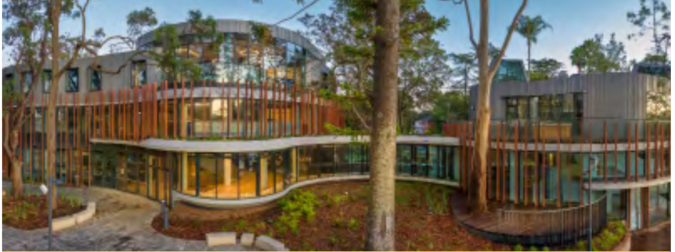
SENIOR SCHOOL SCIENCE AND ART BUILDINGS (COMPLETED IN LATE 2022)

With your help, the next phase of building will become a reality.