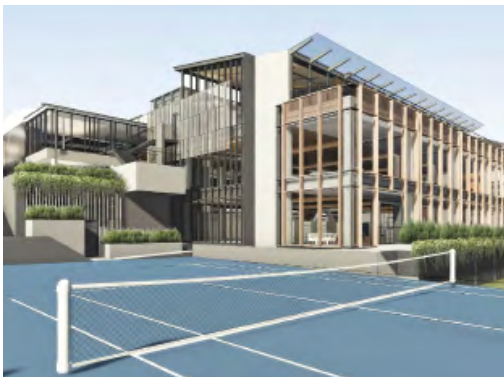
FUTURE SENIOR SCHOOL LIBRARY

Thank you so much to our generous donors for helping to create our new learning environments.