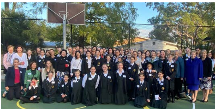
A group of close to 80 including current students and their mothers who are Old Girls along with Old Girls who are grandmothers of students new to Abbotsleigh gathered in glorious sunshine on the Junior School tennis courts for the 2021 AOGU Old Girl Mothers' Breakfast on Friday 30 April.

In particular, Old Girls with daughters in Year 12 and Year 8 were strongly represented as were 1991 leavers with daughters currently at the School.