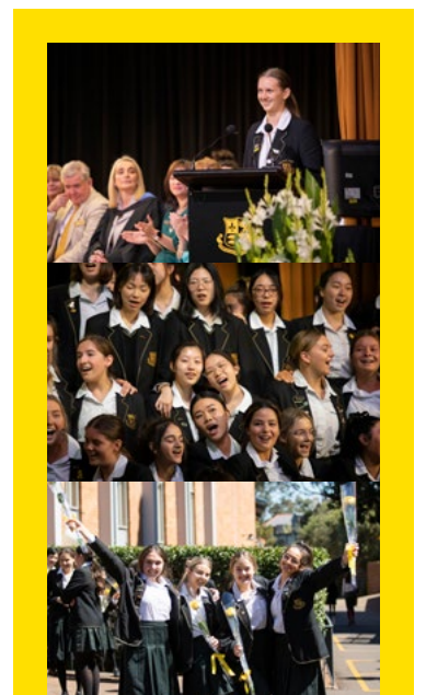
Farewell Year 12