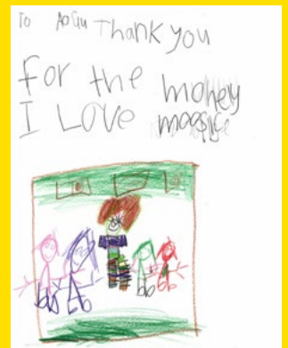
One of the many thank you letters from the children at Hillston Central School